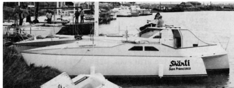
PLANS LEASD WITH FULL SIZE PATTERNS